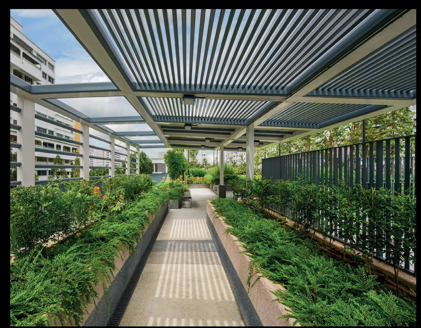
Fully shaded and semi-shaded spaces give residents respite from the elements