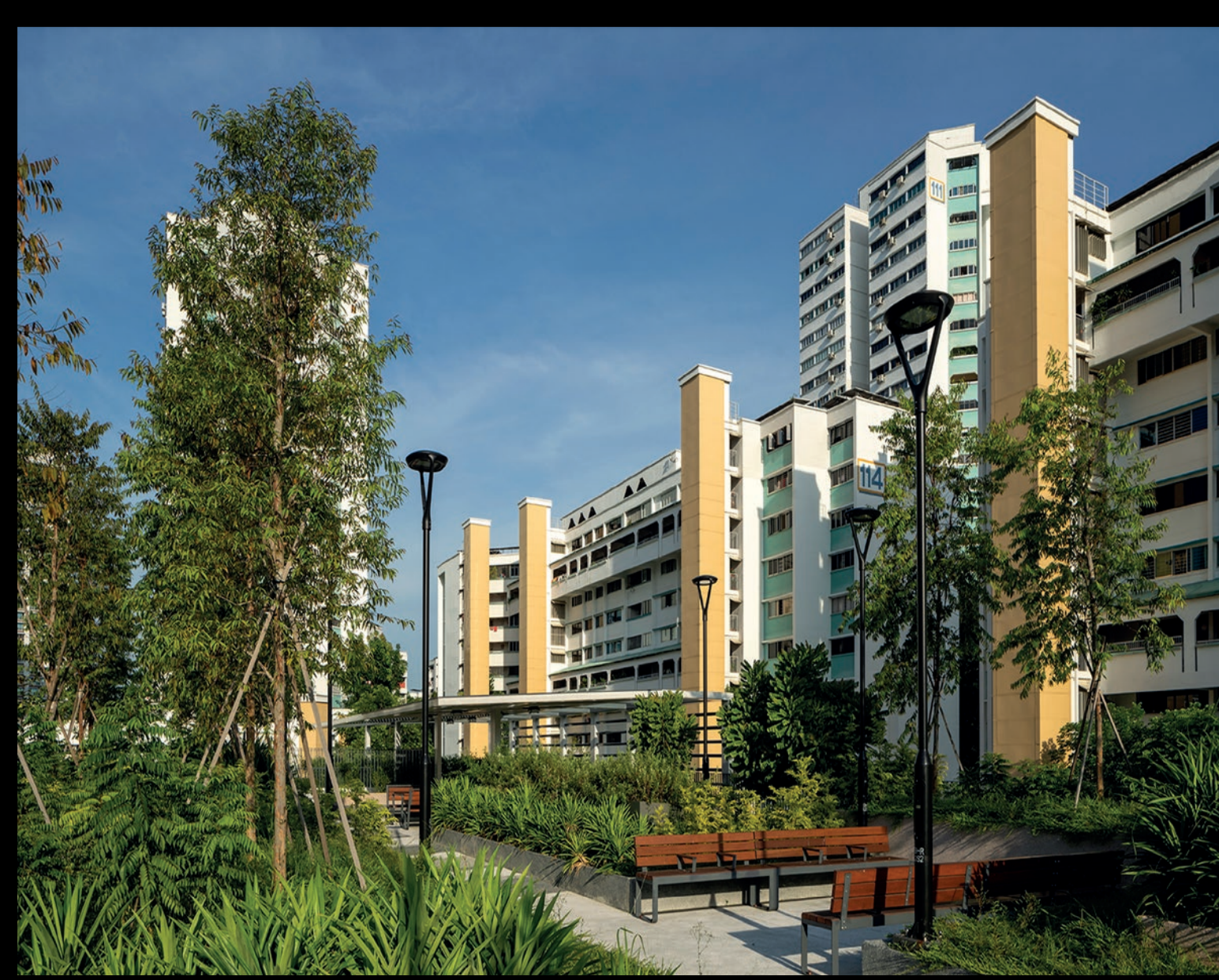
The MSCP roof is lushly planted to give residents a second layer of public green space to enjoy