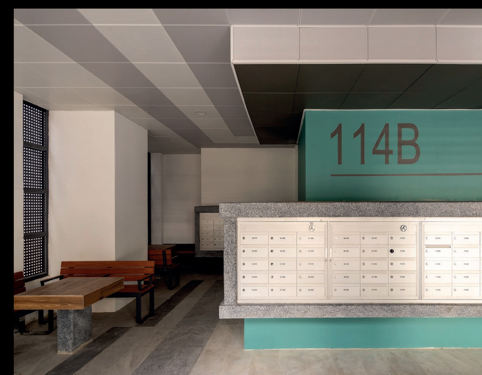
At the 1 st storey, community living rooms are designed for social encounters between residents