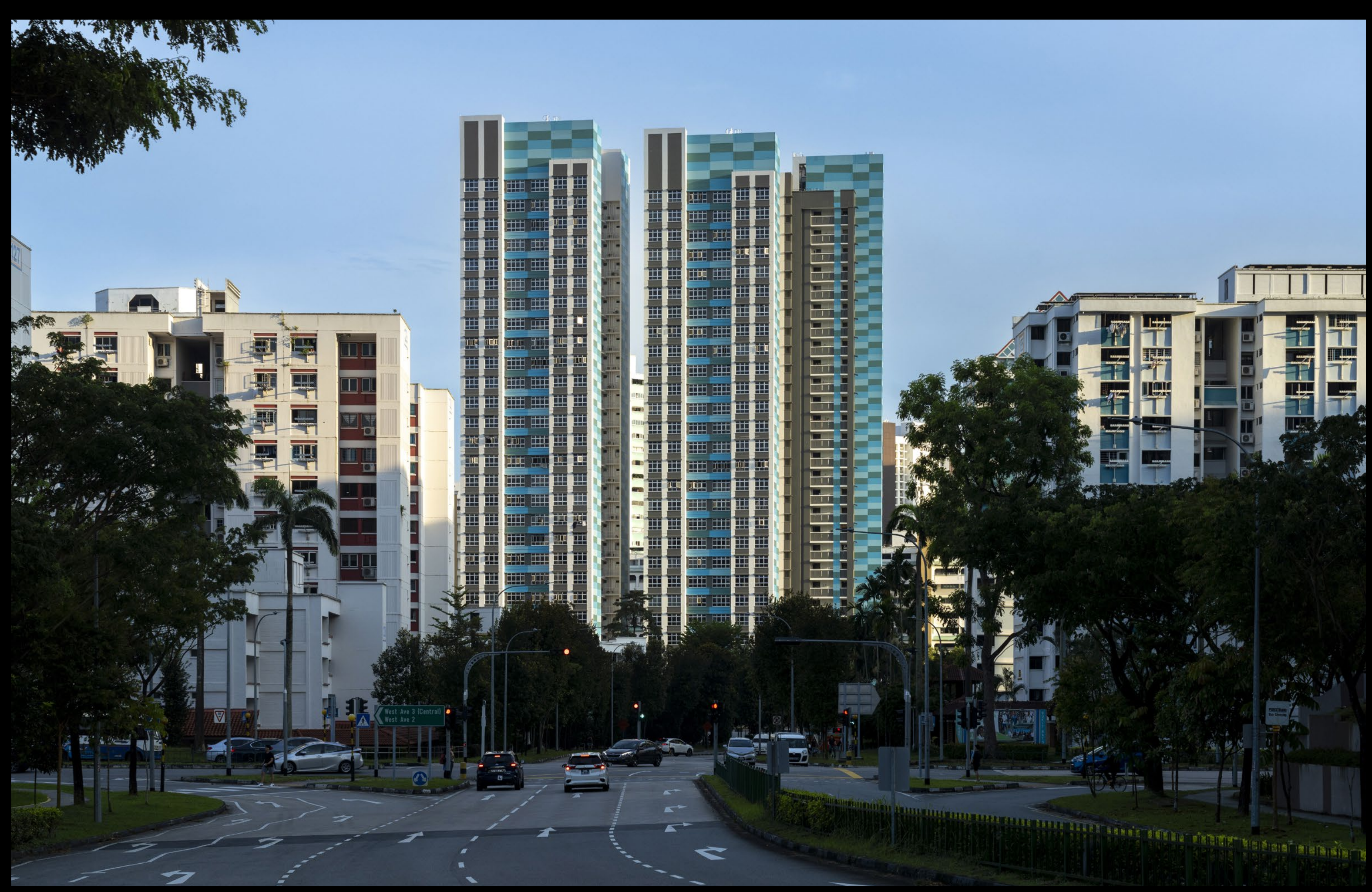
The blocks function as an urban marker within the existing neighbourhood