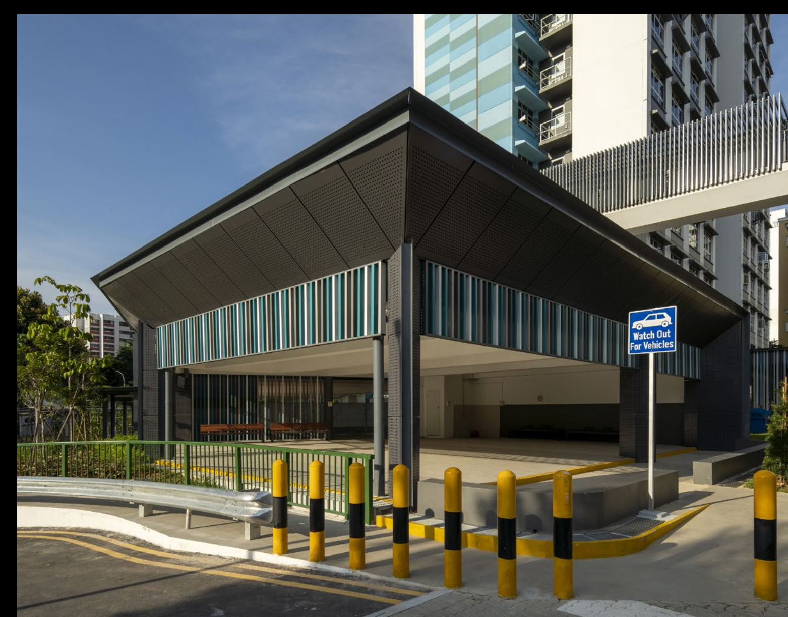
The precinct pavilion is designed with clean modern lines and incorporates key design elements from the residential blocks