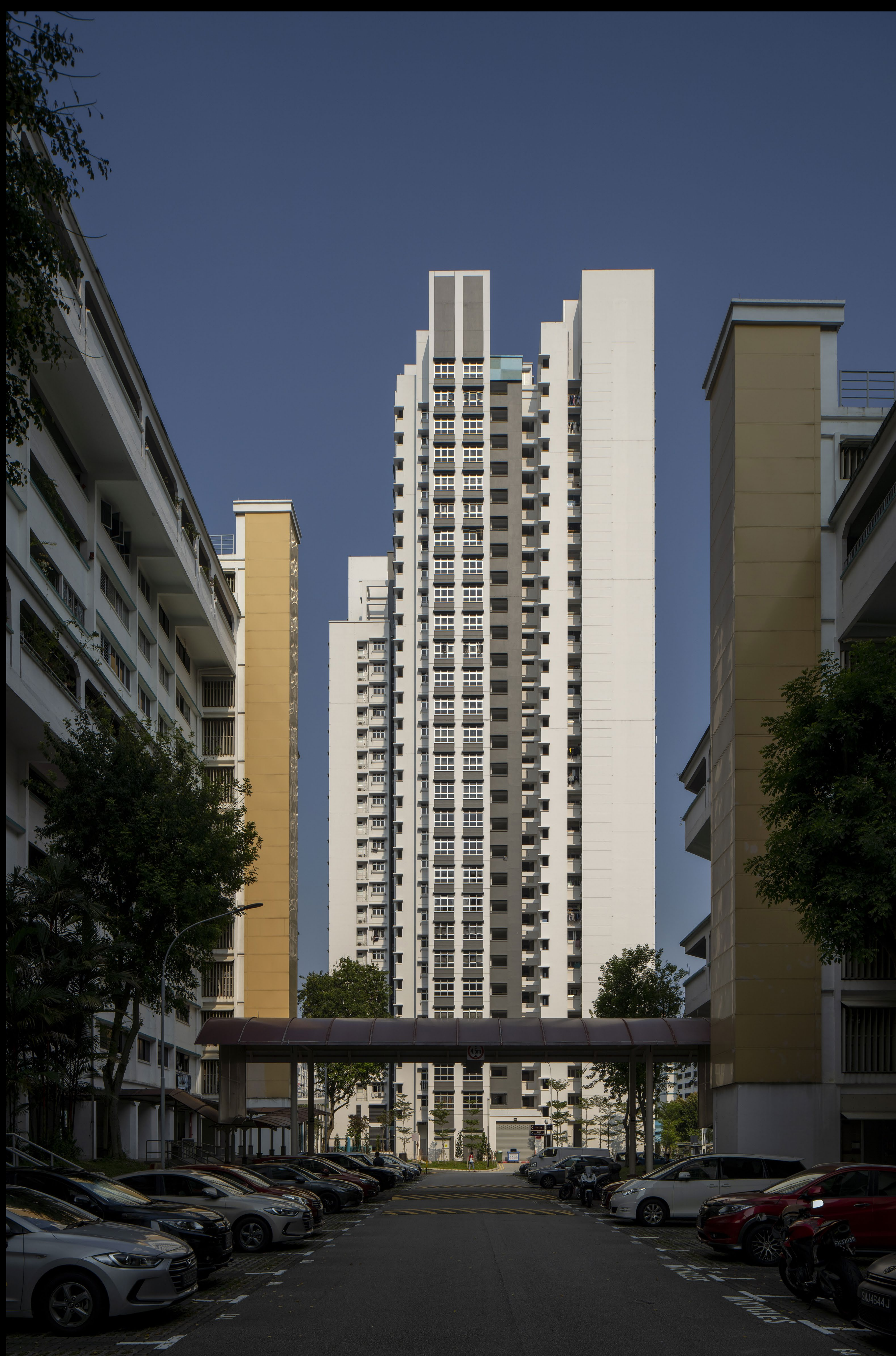
The new building is framed by the old blocks, and seamlessly connected to the existing surface car park