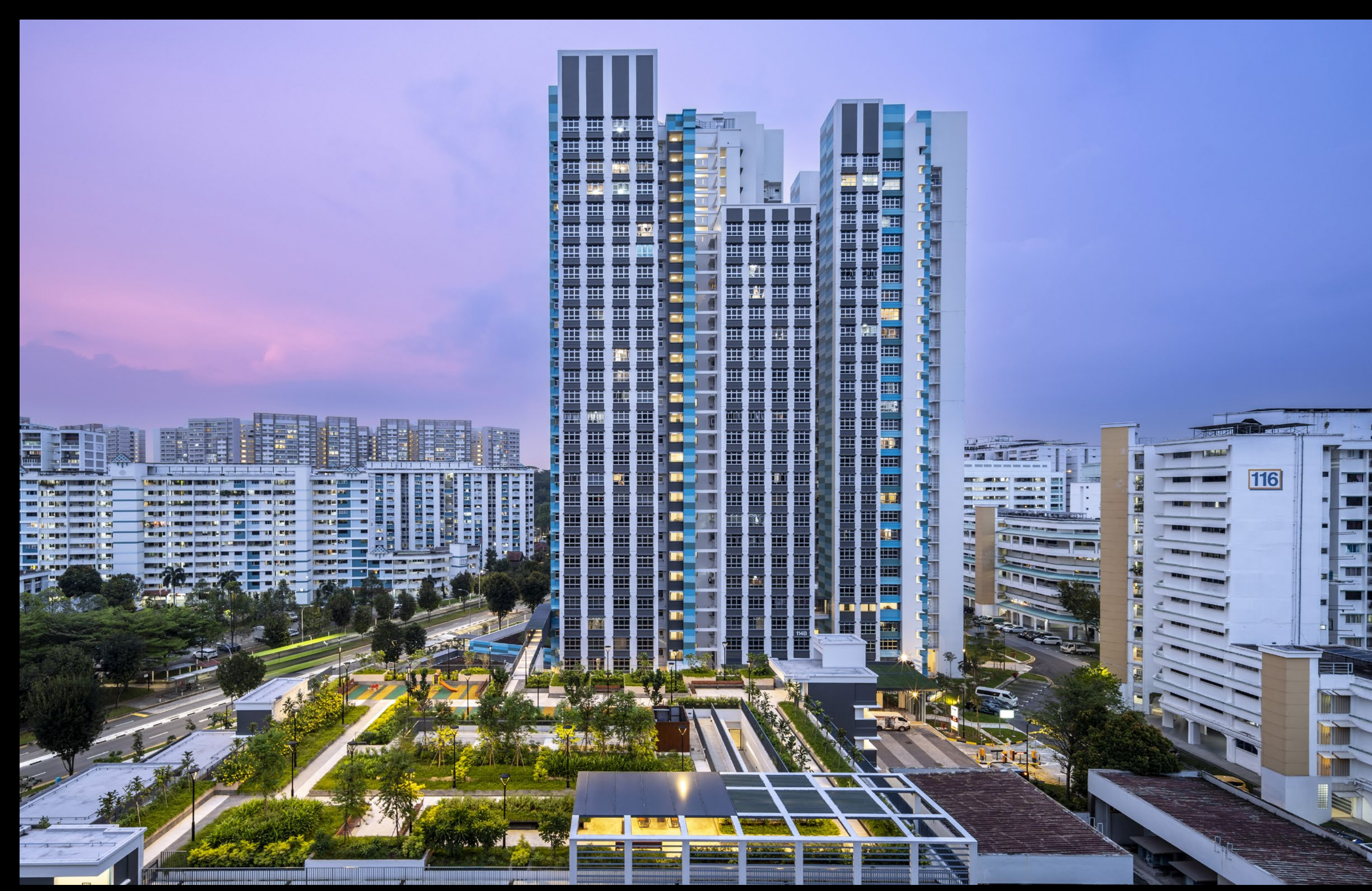
The slenderness and elegance of the blocks are accentuated by vertical elements in the façade design