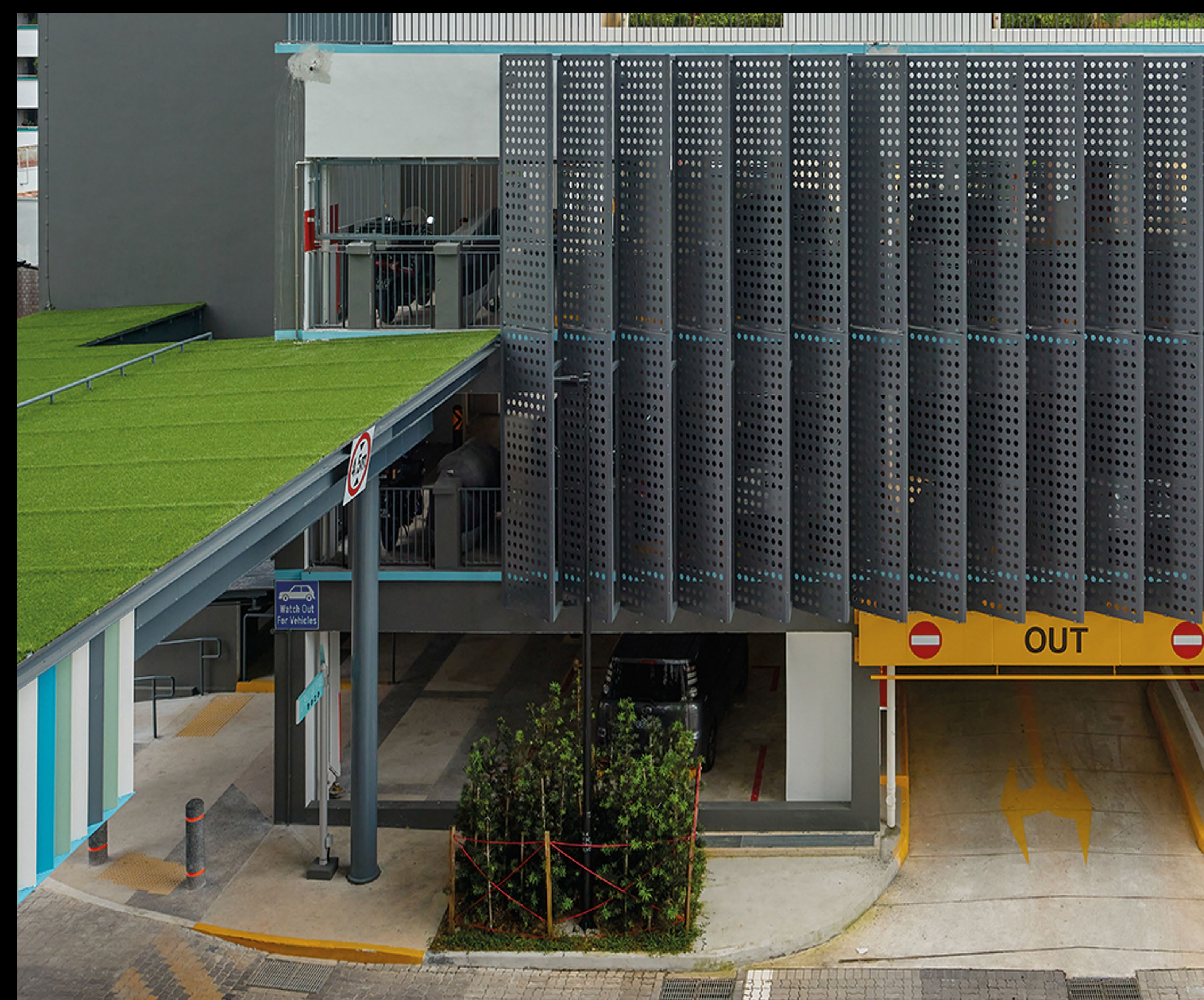
Vertical fins on the MSCP facade improve the utilitarian look of the car park