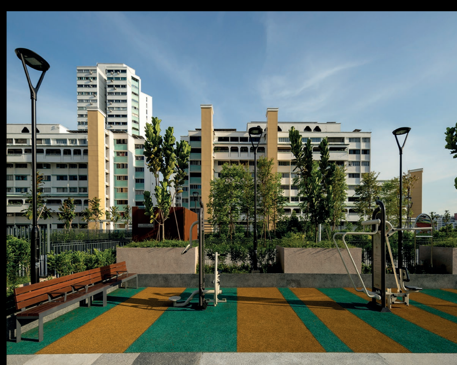
The rooftop fitness corner atop the MSCP is equipped with multi-generational equipment for residents' recreational and fitness needs