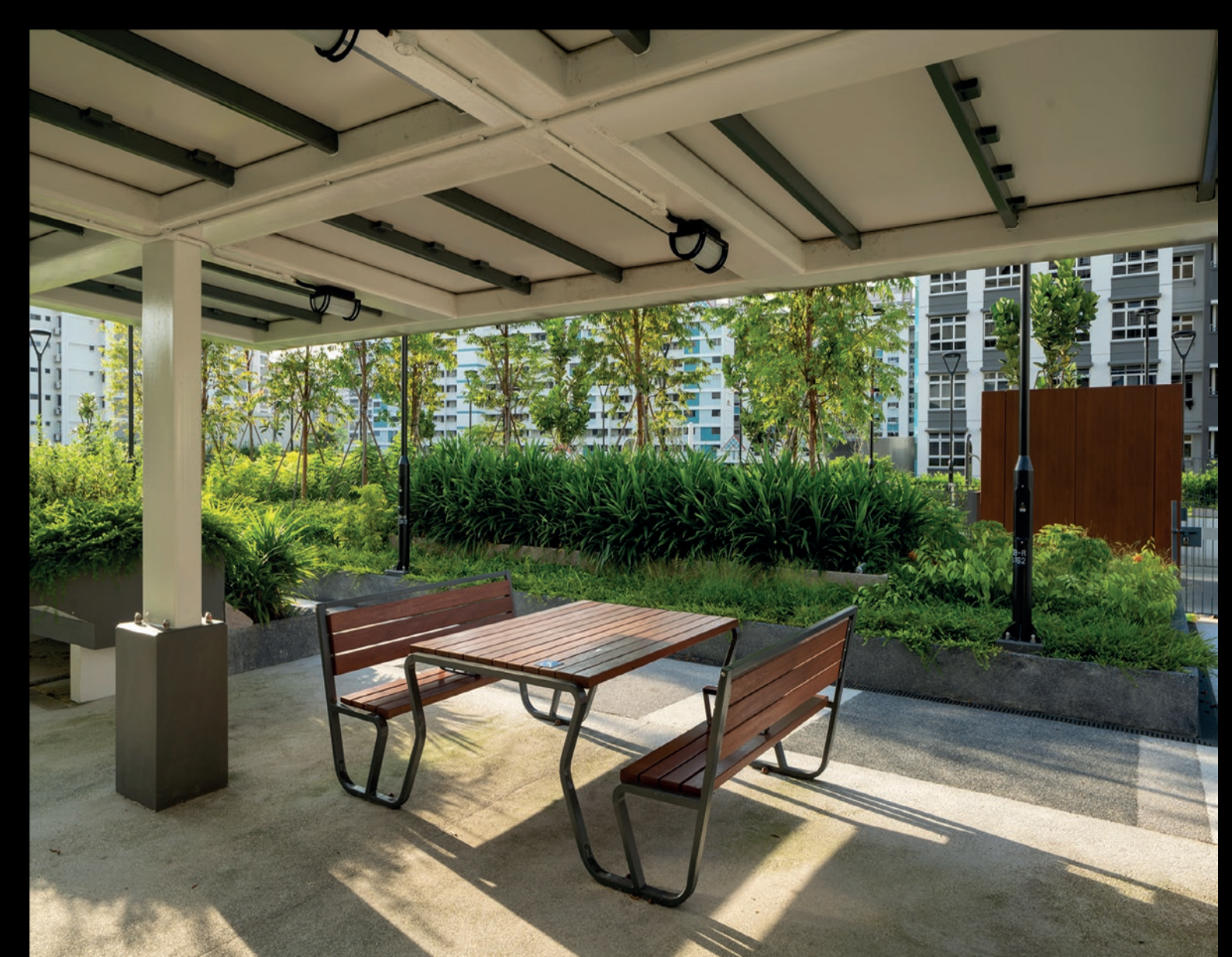
Sheltered seating areas at the MSCP roof are provided for social gatherings