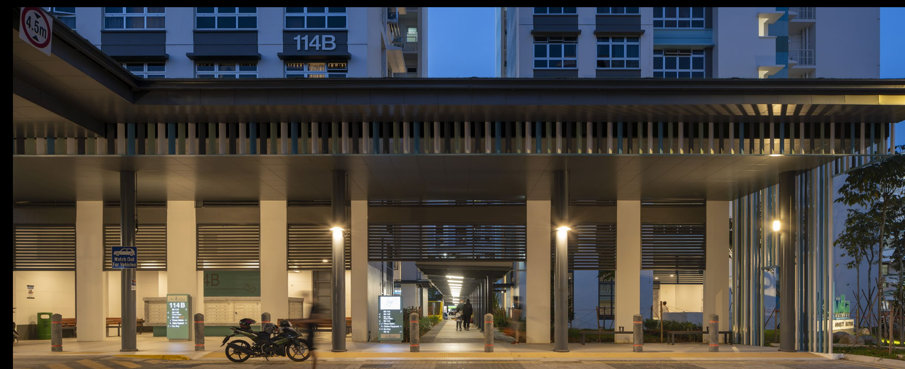
Crisp and refined details are applied onto the secondary structures such as the drop-off porch and precinct pavilion

To overcome the challenge of a small site, Sky Vista's multi-storey car park (MSCP) is used as a roof garden, offering recreational space to the residents. The 2 residential blocks are then linked to it through a network of sky bridges to bring greenery closer to their doorstep.